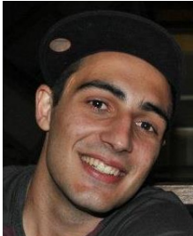
Osama Bin Laden