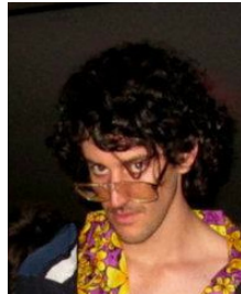
Phil Lynott (Thin Lizzy)