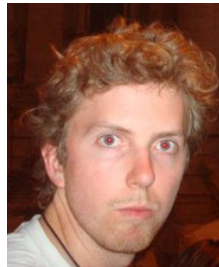
Wendell (from The Simpsons)